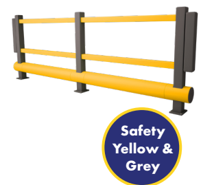
Safety Yellow & Grey