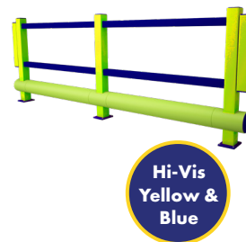
Hi-Vis Yellow & Blue

Fully recyclable, non-toxic and suitable for use in food production and freezer environments.