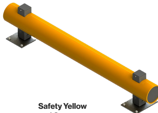
Safety Yellow and Grey

Brandsafe® single bumper barriers have been tested to meet and exceed the global PAS 13 standard, as independently certified by TÜV Nord. Testing demonstrated that at a 90° impact angle, the barrier absorbed 11 kJ of energy, while at a 45° impact angle, it absorbed 22 kJ. These results are equivalent to a 5.7 mph impact from a 3,500 kg forklift, with a measured deflection of 234 mm. All tests were conducted on a concrete substrate, confirming the barrier's strength and durability in demanding warehouse environments.